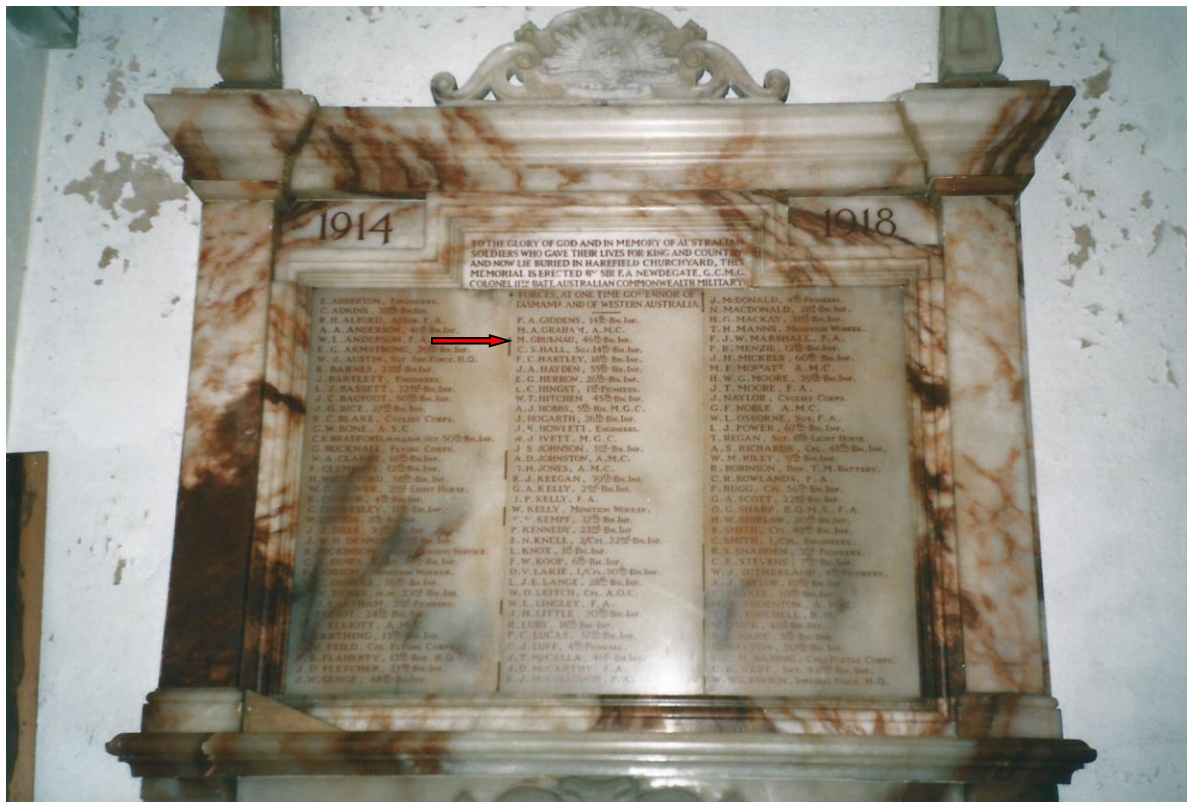
Australian Soldiers' Memorial, Harefield