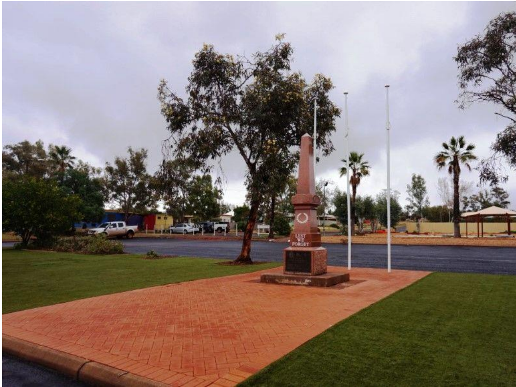
Laverton War Memorial