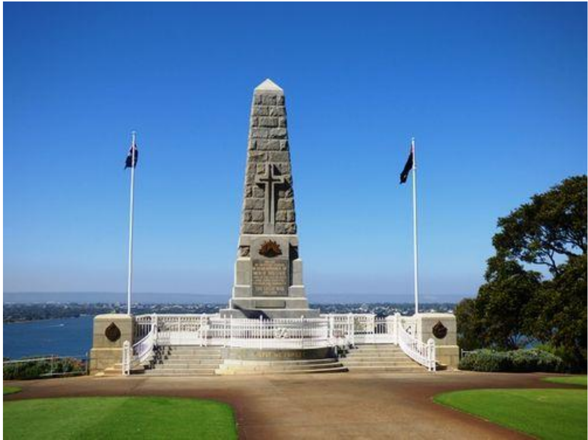
Western Australia State War Memorial Cenotaph, Kings Park (above) & (below) The Crypt with the Roll of Honour names